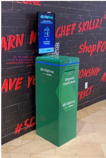
Square One Mall, CA